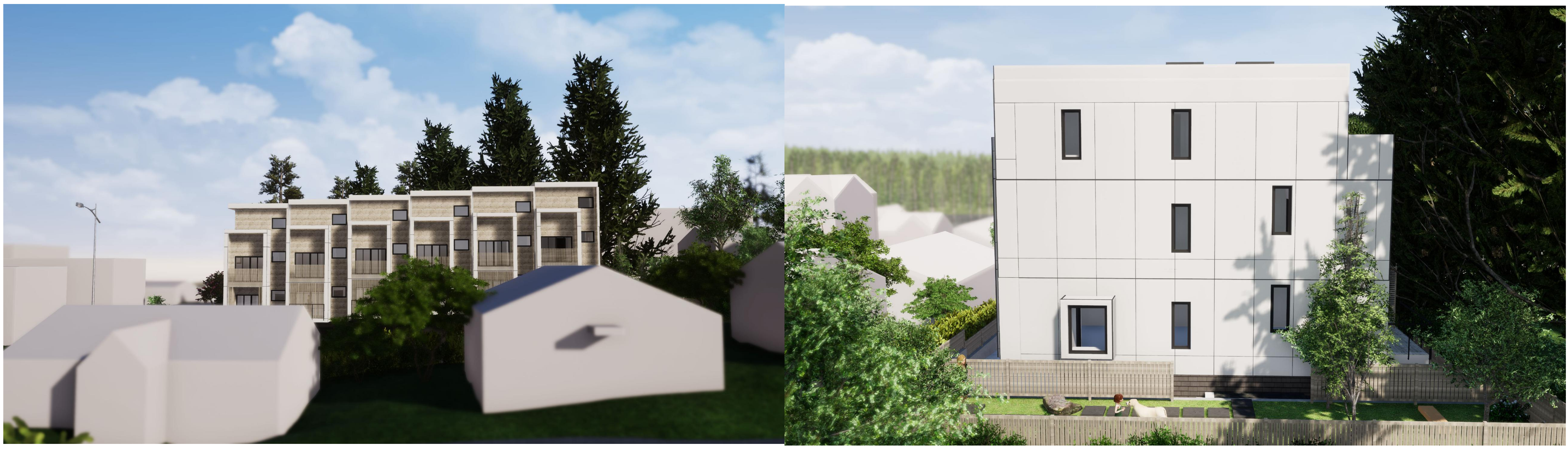
Perspective from Northern Neighbours' point of view, seen from Townsite Rd.