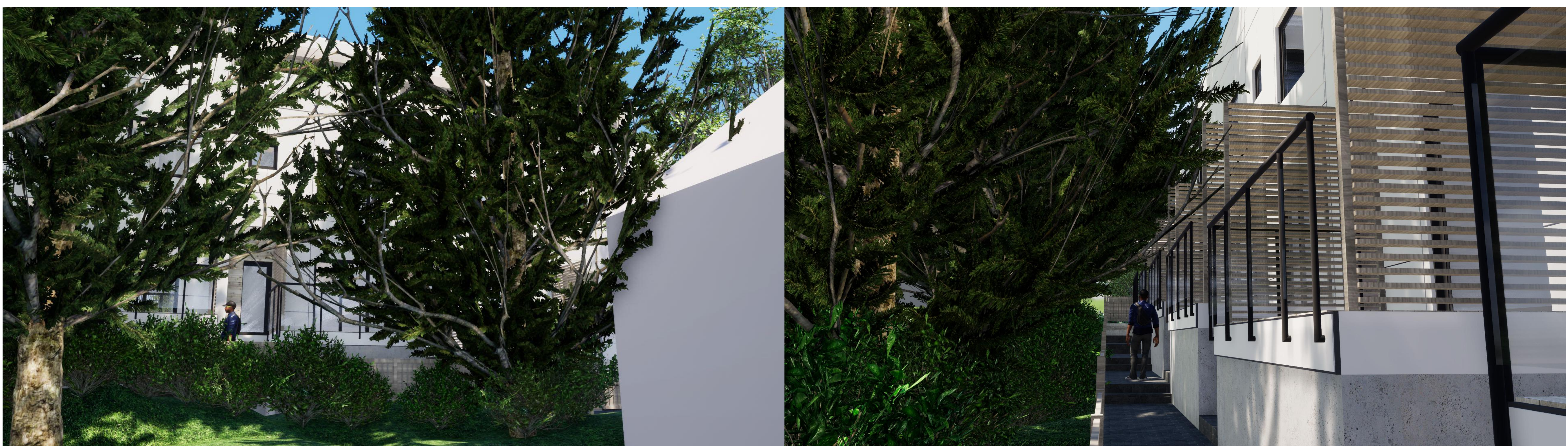
Perspective from Southern Neighbours' point of view, seen from Neighbour Back Yard