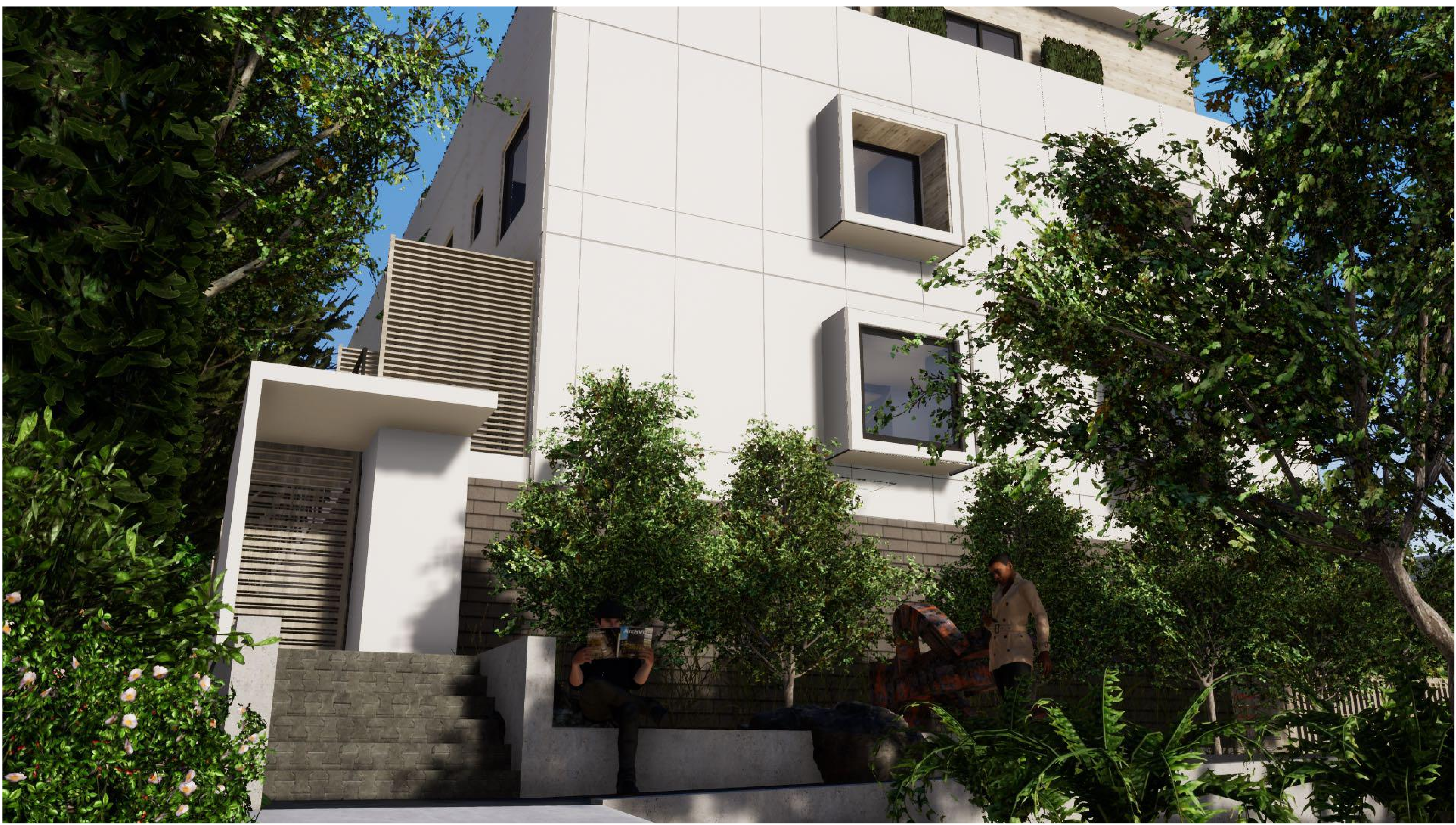
Perspective of landscaped area on front of site and the effect on Streetscape; looking South-East.