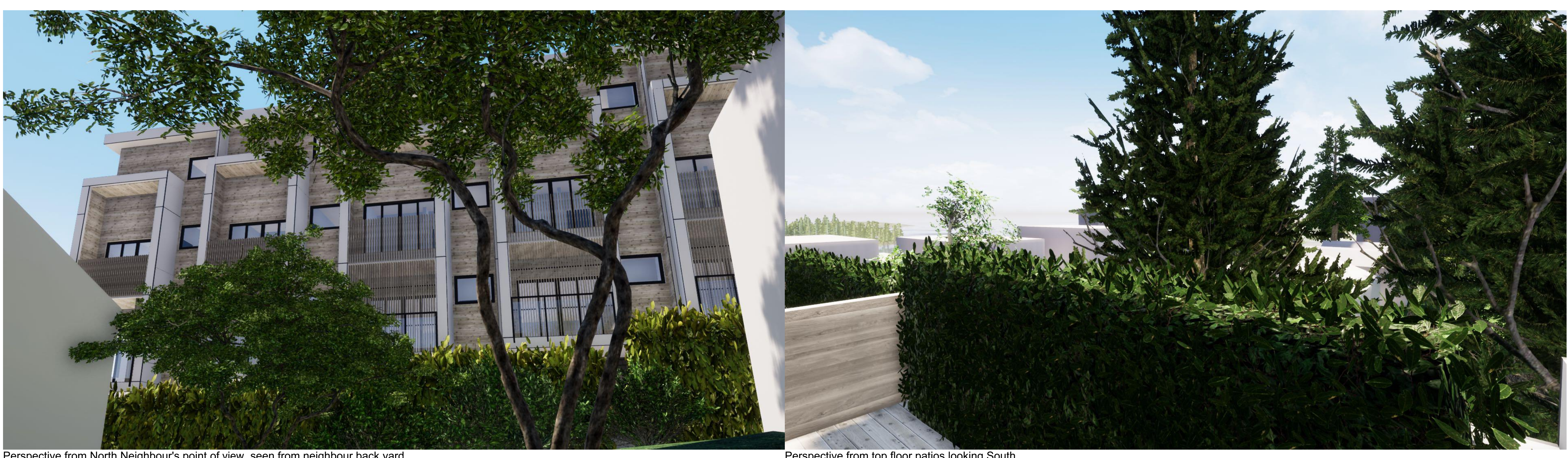
Perspective from North Neighbour's point of view, seen from neighbour back yard.